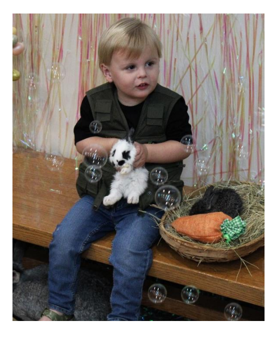
Hop on in to the library!

Children enjoyed photo opportunities with real live Easter bunnies during Hippity-Hoppity Tales.